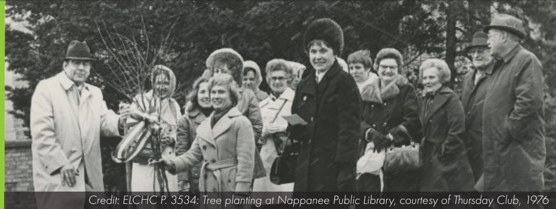
Tree planting at Nappanee Public Library, courtesy of Thursday Club, 1976