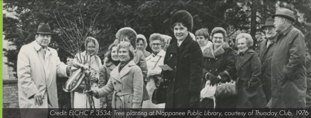
Tree planting at Nappanee Public Library, courtesy of Thursday Club, 1976