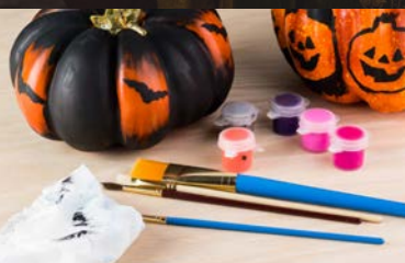
Pumpkin Painting, October 13