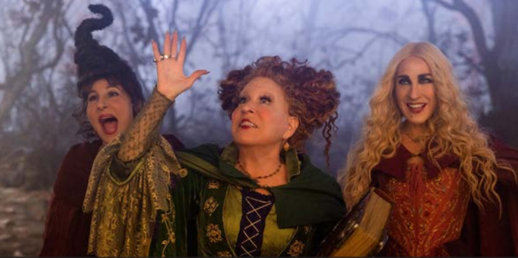
Teen Movie Night, October 25