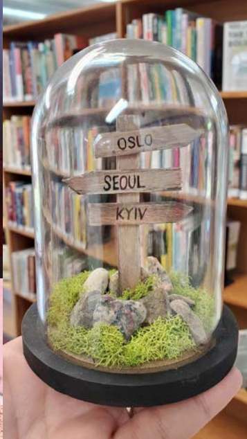
Mini Signpost, November 22